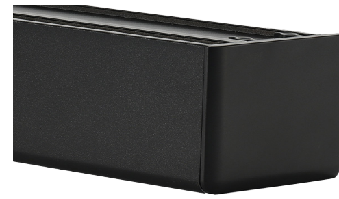
Large Curved Box #22

Colour: Titanium Height: 84mm Width: 79mm