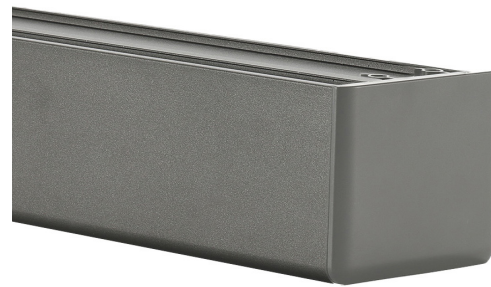
Curved Box #21

Colour: Titanium Height: 84mm Width: 79mm