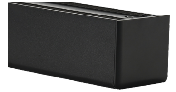
Large Curved Box #22

Colour: Titanium Height: 84mm Width: 79mm