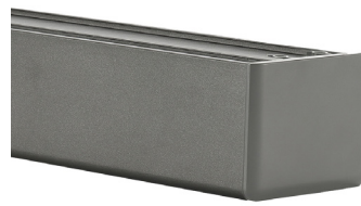
Curved Box #21

Colour: Titanium Height: 84mm Width: 79mm