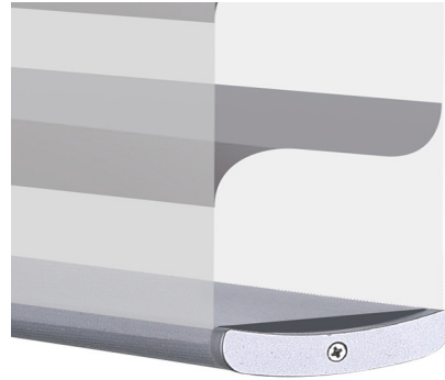
LumaFlo Shade Bar #107

Colour: White Height: 12.5mm Width: 52mm