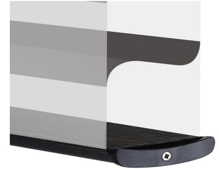
LumaFlo Shade Bar #107

Colour: Titanium Height: 12.5mm Width: 52mm