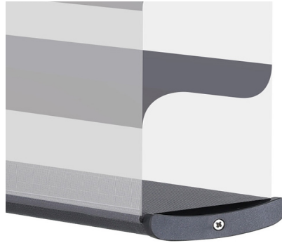
LumaFlo Shade Bar #107

Colour: Titanium Height: 12.5mm Width: 52mm