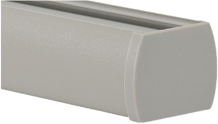
Honeycomb Box #18 Colour: Grey Height: 99mm Width: 50mm