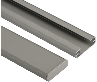
Honeycomb Bar #56 Colour: Grey Height: 12mm Width: 45mm