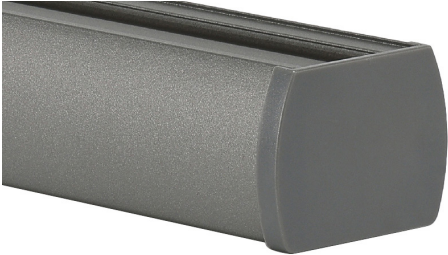
Honeycomb Box #18 Colour: Titanium Height: 99mm Width: 50mm