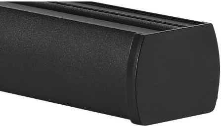
Honeycomb Box #18 Colour: Black Height: 99mm Width: 50mm