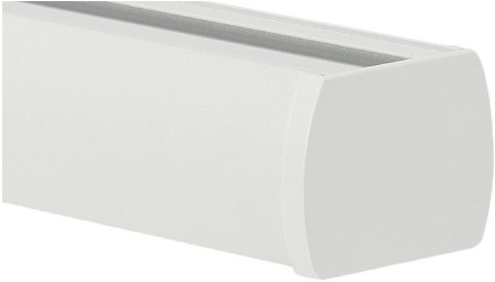
Honeycomb Box #18 Colour: White Height: 99mm Width: 50mm