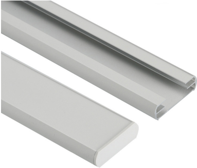
Honeycomb Bar #56 Colour: White Height: 12mm Width: 45mm