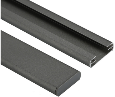
Honeycomb Bar #56 Colour: Titanium Height: 12mm Width: 45mm