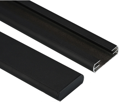
Honeycomb Bar #56 Colour: Black Height: 12mm Width: 45mm